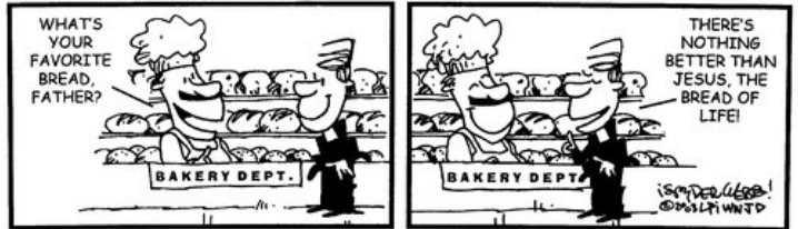
20TH SUNDAY IN ORDINARY TIME