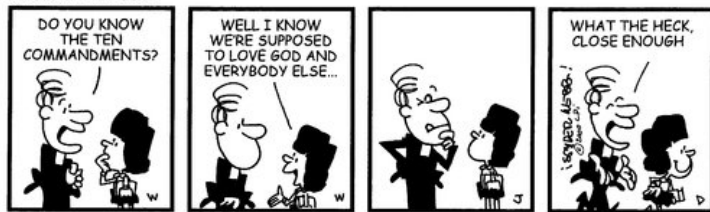
3D SUNDAY OF LENT