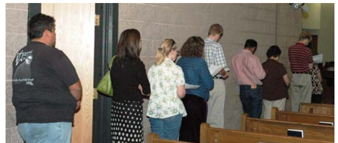
IN LINE FOR CONFESSION

Bring a Friend to Mass. Our Lord will thank you!